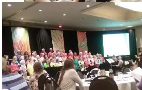
June 19 th - 24 th