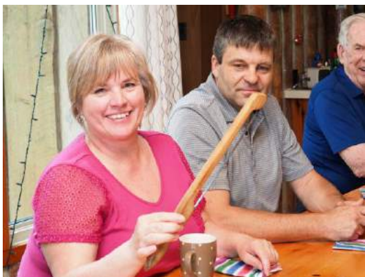
Or perhaps a slice of bread...now that's a bread knife!!